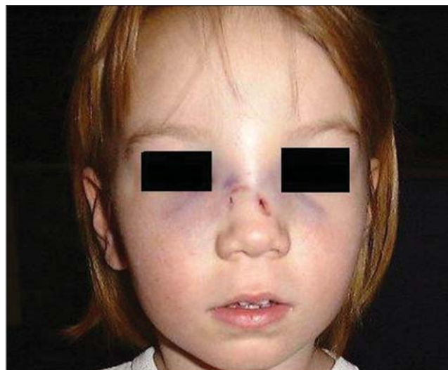
Picture 1. A girl with post-fall nasal fracture.

Other studies that evaluate the nasal fracture specifically are required to enable a major epidemiologic knowledge and a better standardization of this affection diagnosis and treatment.