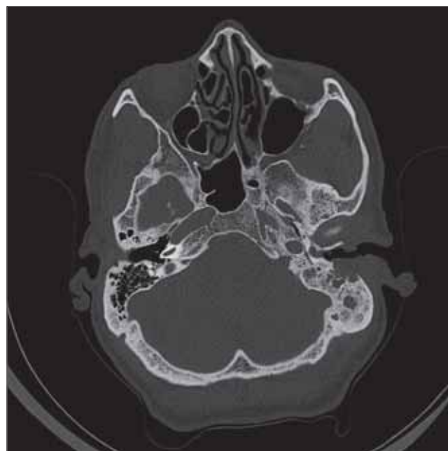
Picture 2. CT at axial cut, confirming affection of the external auditory meatus.

cells carcinoma is the most common histological type, followed by the basocellular carcinoma, adenoid cystic carcinoma, adenocarcinoma and rhabdomyosarcoma (9).