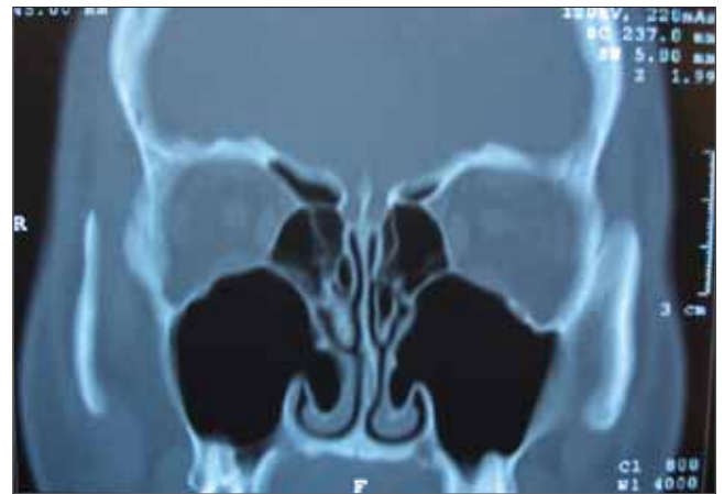
Picture 1. Coronal CT showing the inferior turbinates pneumatization.

The preoperative routine endoscopic exam appointed obstructive and non-responsive inferior turbinates volumetrically upon vasoconstriction, as well as septal deviation.